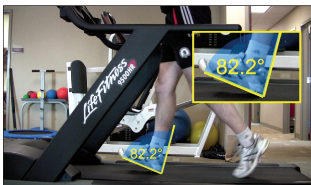
Figure 2: Same runner as in figure one with increased dorsiflexion and heel strike landing pattern as is common in shod running gait.